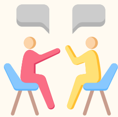
人際關係 Interpersonal Relationships

Baptist Oi Kwan Social Service has introduced the "Re:Fresh E- Platform", providing the public with an interactive online self-help programme for emotional well-being tailored to their lifestyle. It enables people to easily incorporate self-care practices into their daily schedules, no matter where they are, in order to avoid emotional breakdowns. Based on studies conducted by the American College of Lifestyle Medicine and the National Wellness Institute, the programme chooses six achievable health objectives and offers expert guidance to help people maintain a well-rounded lifestyle, making it easier to prioritise emotional well-being.