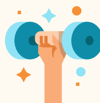
運動與健康 Exercise and Health