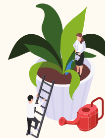
個人成長 Personal Development