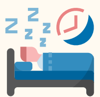
休息與睡眠 Rest and Sleep