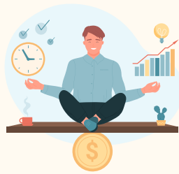
工作與財務管理 Work & Financial Management